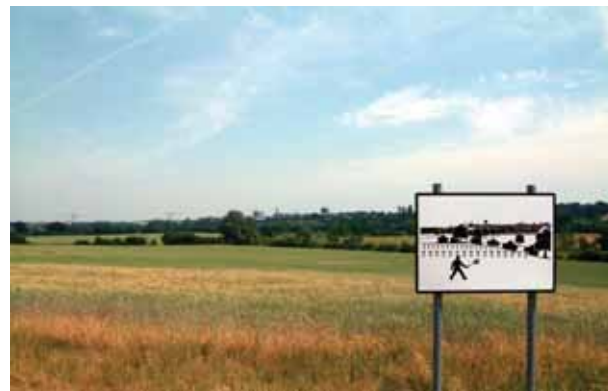
Michael Goodey, image from The View Finder Trail , 2005.

This reflective vinyl sign, mounted on aluminium panel, depicts a view of the town of Colchester, Essex, with Jumbo, the distinctive Victorian water tower, and the Town Hall spire in the distance. The image is constructed using a collage process based on the lexicon of international road traffic signage – trees, the symbol for corn, cars, water, etc. The figure shown in the foreground holding a tennis racket refers to the municipal sports ground just off-picture to the right towards which he is evidently walking.